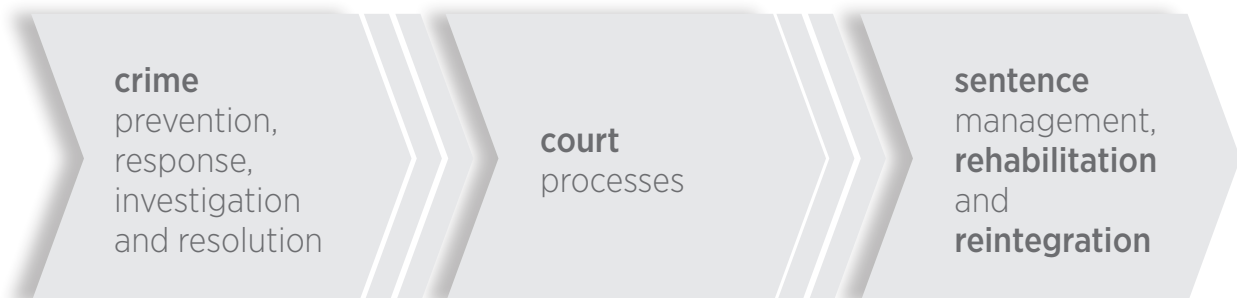
FIGURE 1 THE CRIMINAL JUSTICE PIPELINE

The concept of a criminal justice pipeline (described below) recognises the interdependencies between the activities of justice sector agencies. Policies and approaches in one part of the pipeline can have significant effects on others.